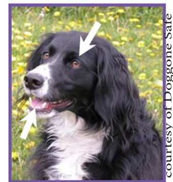
I like you