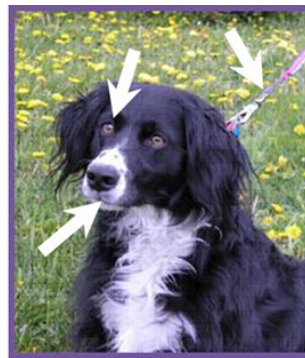
I'm worried, stay away

The noise of children playing and running around can be a huge attraction for many dogs but others will find it frightening. Even the friendliest of dogs can become startled and bite if they feel threatened or scared.